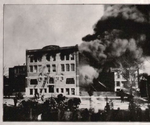
THE above cut shows our fire in progress as taken by the photographer of the local paper, whose enterprise put its man on the ground with the first rank of the fire department. It was one of the fiercest fires ever seen in this part of the city, the entire structure, four stories high, with floor space of over 50,000 square feet, going down, a total loss, in but little over one hour. Cause of fire supposed to be a fault in electric wiring.

We look back at a disaster and forward to a triumph, linked by the dangers of "faulty wiring." This 1905 electrical fire devastated our home, but we built back bigger and better with an improved production facility, new lab and power plant. Fast-forward almost 120 years and we are building smaller and better to address faulty wiring in the heart.